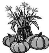
Harvest Day Sunday, October 23rd

A friend was in front of me coming out of church one day, and the preacher was standing at the door as he always is to shake hands. He grabbed my friend by the hand and pulled him aside. The Pastor said to him, "You need to join the Army of the Lord!" My friend, "I'm already in the Army of the Lord, Pastor." Pastor questioned, "How come I don't see you except at Christmas and Easter?" He whispered back, "I'm in the secret service...details...."