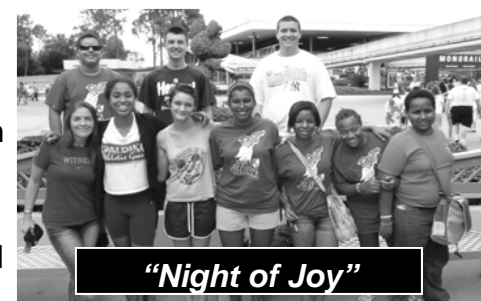
"Night of Joy"

September was a busy month for The Nativity Teens. They had their first trip, participated in WestFest and had a sports night at the park.